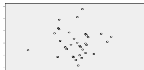
Figure 2. Heteroscedasticity Test Result

An instrument is valid if it can accurately measure the desired variables and reveal data from them. The instrument's validity level indicates how closely the collected data matches the variables in the study description in question. The R-x.y product-moment table was used to determine whether a question item from the questionnaire instrument was valid or not, with a significant level of 5%. When measuring a different symptom, a measuring instrument is reliable if it always measures the extent to which the measuring device is reliable and dependable. To measure instrument reliability, use Cronbach's Alpha based on the average correlation of the measurement instrument data items. If the Cronbach Alpha value is greater than or equal to 0.6, an instrument is reliable. The validity and reliability tests performed on the instrument items used in the study, which revealed that all of the research instrument items were valid because they met the criteria for testing the instrument's validity items.