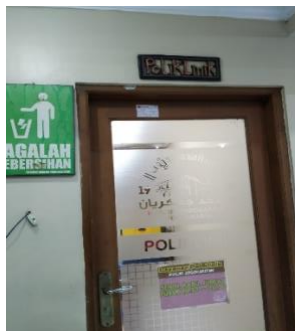
Figure 4. Jogokariyan Mosque Polyclinic

they get outward benefits and get inner benefits by attending congregational prayers in the mosque. Thus, indirectly takmir also fulfills two of their responsibilities, namely paying attention to the health of the congregation and inviting the public to pray in congregation at the mosque.