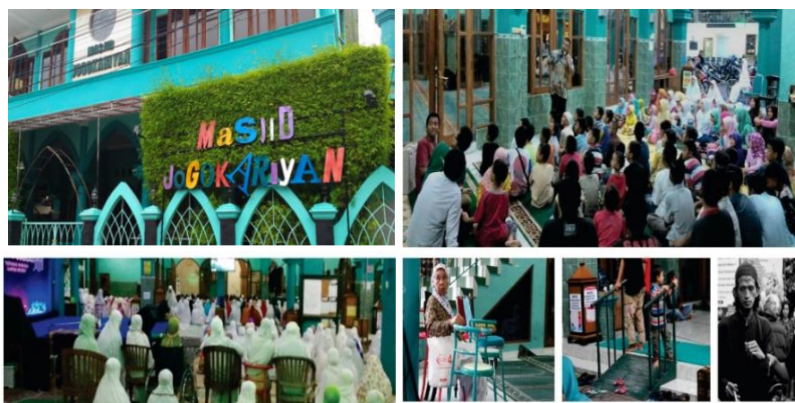
Figure 2. Jogokariyan Mosque is Child Friendly, Elderly and Disabled

Besides providing congregations in general with the best prayer facilities, attention is also paid to various other facilities needed by pilgrims with special needs, such as the elderly, people with disabilities, and children. How the mosque provides facilities for congregants with special needs is demonstrated by (charity). The findings of observations, namely the provision of special prayer shafts for children, prayer chairs for the elderly who can not stand prayer, access roads by rallying to help elderly congregations; and people with disabilities go to places of ablution and toilets, ramps (sloping roads) to help elderly and disabled wheelchair users and other walking aids to be able to enter the mosque to worship.