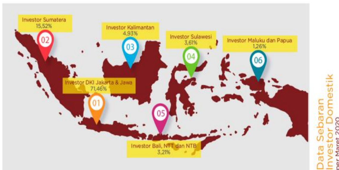
Figure 2. Distribution of Domestic Investors in Indonesia as of March 2020

Interest is also an important factor for investors to decide to invest with knowledge capital and financial efficacy. Merawati & Putra, (2015) revealed that investment interest is the desire to find out about the type of investment, willing to take the time to learn more about investment by attending training and seminars on investment and trying to invest. Tandio & Widanaputra, (2016) stated that investment interest is influenced by capital market training and returns, while perceptions of risk, gender, and technological progress do not significantly affect.